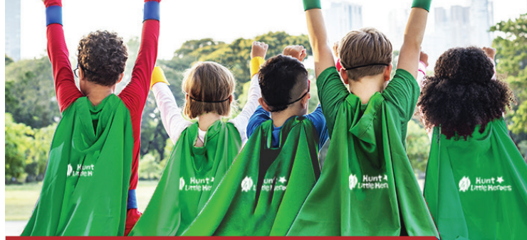
HUNT LITTLE HEROES CONTEST ENDS - APRIL 30TH