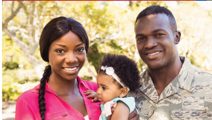
MAY IS MILITARY SPOUSE APPRECIATION MONTH