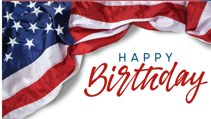
U.S. ARMY'S 248TH BIRTHDAY - JUNE 14TH