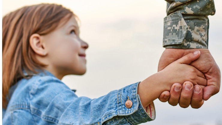
APRIL IS MONTH OF THE MILITARY CHILD